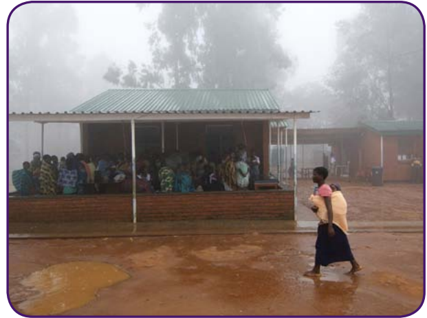
Figure 1: Patients keep dry at an outpatient clinic at Neno District Hospital, Malawi, during the rainy season

Weather will also affect the timing and types of construction. In areas with heavy rainfall, land erosion can be a problem. Roofing may need to be reinforced in climates with heavy snow. In both warm and cold climates, temperature control and ventilation must be considered in the design and construction process. Unexpected situations can arise at any stage of the process; anticipating problems can help keep operations continuing efficiently.