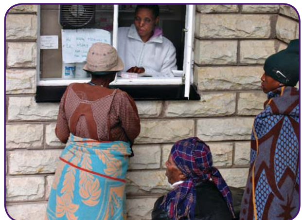
Figure 6: Women pick up prescriptions at a PIH-supported pharmacy in Lesotho

Check whether there is an adequate waiting area—ideally outside and shaded in warm climates—to accommodate patients waiting to receive medicines at the dispensary. If you plan to use the pharmacy as the main stock area for your medicines and other medical and surgical consumables, the storage should be separated from the dispensing area. If not, a pharmacy can be little more than a room with a door that locks, ample shelf space, and a window through which medicines can be dispensed. Remember