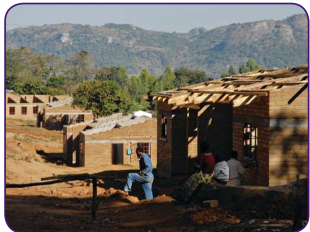
Figure 11: Constructing staff housing in Malawi

If you plan to build or renovate staff housing, check with local authorities for any regulations pertaining to the construction; be aware that in some countries, the government decides which levels of staff have priority for housing. When drawing up a design, consider the most appropriate one for your staff needs: dormitory-type housing, single housing, or multiple occupancy—each has different requirements. Remember to consider the location of the water supply when planning the sanitation facilities and plan for how you will provide power.