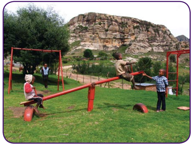
Figure 4: Children play on the clinic grounds in Lesotho