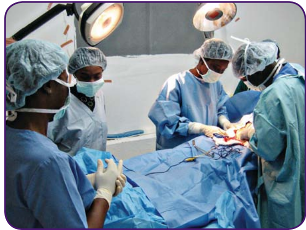
Figure 8: Clinicians deliver a baby in the operating room at Zanmi Lasante in Haiti

Providing surgical care in resource-poor settings is a complex endeavor, so most health centers and clinics focusing on primary care do not include surgical care in their range of services, at least initially. It is important to plan carefully before proceeding with this service. If your area has a need for surgical care that cannot be addressed at the regional or district level, start by preparing your facility for emergency surgery only, such as cesarean sections or trauma cases. Consider building a procedure room to enable doctors to perform cesarean sections and other emergency procedures.