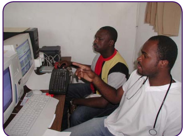
Figure 17: Staff enter patient data into OpenMRS, an open-source electronic medical record system, at Zanmi Lasante in Haiti

You may be able to purchase computer equipment locally. Although the items may be more expensive than those outside the country, you may be able to offset the increased price by saving on shipping costs. The number of computers will depend on usage at your site, your budget, and the existing telecommunications infrastructure. (For more information on the factors influencing such purchasing decisions, see Unit 4: Managing a procurement system. )