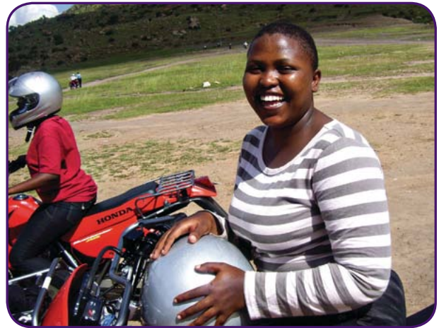
Figure 13: A village health worker travels by motorcycle to reach patients in Lesotho

Keep in mind that if the site is located in a remote rural part of the country, you may need to rely on other modes of transportation. Motorcycles can improve staff access to patients living in more remote areas. Riders will need some training, as well as helmets and protective clothing. Many countries also require specific motorcycle licenses. If the terrain is not too mountainous, bicycles are another less expensive option for reducing travel time.