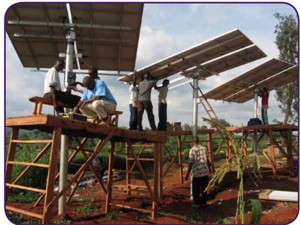
Figure 15: Workers install solar panels to help power a PIH-supported hospital in Rwanda

These systems can be expensive, particularly in terms of the initial capital costs. However, relying on gas-powered generators at a time of big increases in fuel prices may not be a cost-effective option for the future. Just as important, solar power systems are environmentally sound because they do not emit carbon dioxide or other greenhouse gases.