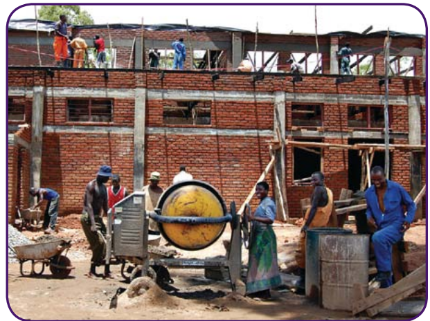
Figure 2: Locally hired staff construct the Butaro District Hospital in Rwanda

PIH uses architects and engineers for design, structural assessments, and precise material specifications, and relies on qualified electricians and information technology (IT) experts for major work. While this assistance can incur additional costs, in the long run it helps to ensure the structural integrity of buildings and major infrastructure projects and it supports good business practices. Some national standards may mandate the use of architects, engineers, and other specialists in the construction process. Hiring local people and collaborating with local officials on the construction plan and its implementation builds trust and a sense of partnership with the community and can encourage people to use the health services you provide.