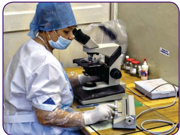
Figure 7: A technician working in a PIH-supported laboratory in Tomsk, Russia

for testing will depend on the clinical services you provide, national protocols for diagnosis and treatment of specific diseases, and your budget and service capacity.