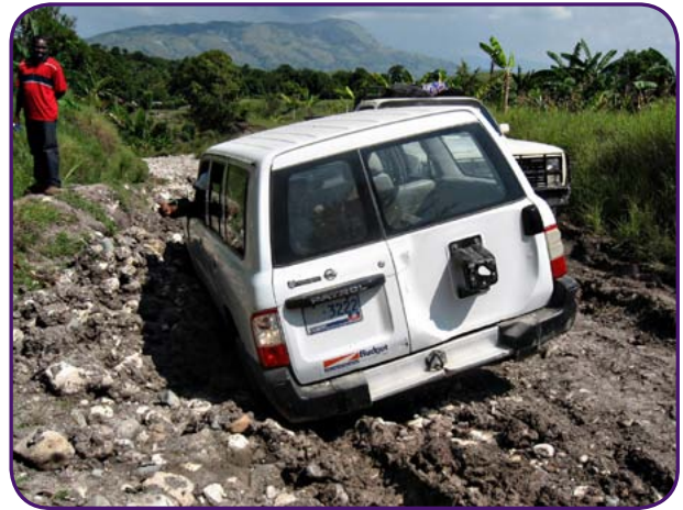
Figure 12: Haiti's roads cause frequent wear and tear on vehicles

Find out whether there are norms or standards for vehicles used to transport patients. If you purchase a vehicle, consider your budget as well as the site's location and local weather conditions. Even when roads are not cut off by rains or storms, travel on poorly maintained roads can be dangerous and can lead to frequent breakdowns—the wear and tear on even the hardest vehicles can be significant. For transporting patients and staff, you may want to purchase all-terrain vehicles that can accommodate several people.