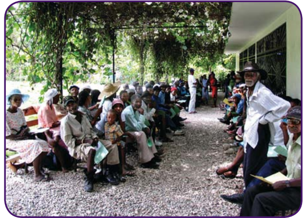
Figure 5: Patients wait for care outside the Zanmi Lasante clinic in Lacolline, Haiti

Provide covered, comfortable waiting spaces with seating for patients and caregivers. In warm or temperate climates, these areas should be outdoors. Wherever possible, designate a separate waiting space for patients with highly communicable infections, such as TB, to encourage proper infection control. To facilitate patient intake and triage, establish a prominent area where patients have their first point of contact with staff. Remember to allow enough space for the patient and staff to interact.