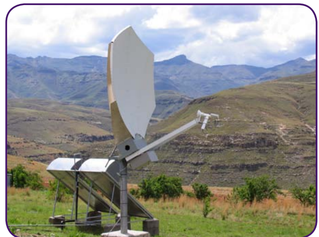
Figure 18: PIH-supported mountain clinics in Lesotho are connected to the Internet by satellite (VSATs)

Check first on license requirements in-country. Some countries have heavily