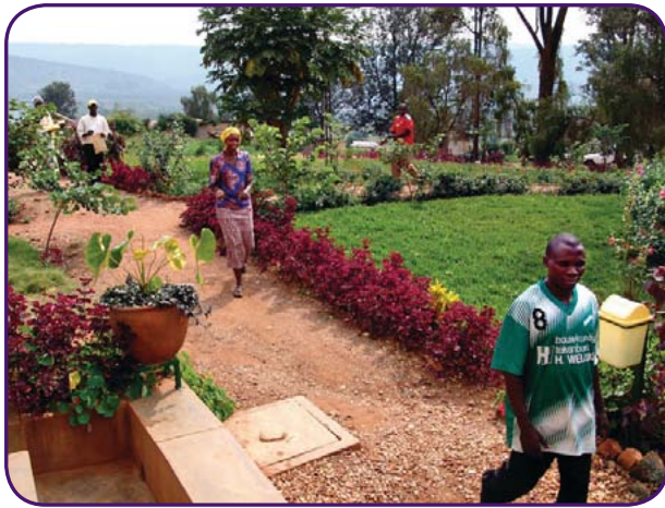
Figure 3: Gardens on the grounds of Rwinkwavu District Hospital in Rwanda