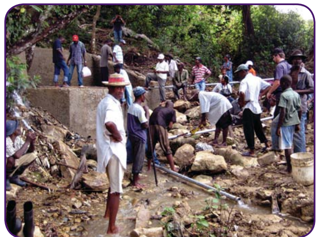
Figure 14: Local workers lay pipes to bring water to the community and to Zanmi Lasante in Haiti