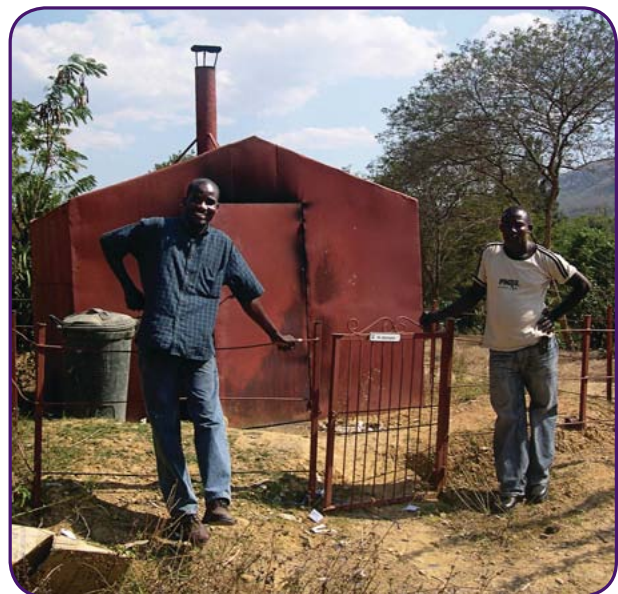
Figure 9: Local staff construct an incinerator at Zanmi Lasante in Haiti

In many developing countries, incinerators are commonly used for the final disposal, and environmental regulations or guidelines may exist for their use. There is a variety of incinerators to choose from, ranging from prefabricated metal ones to incinerators made from bricks that can withstand high temperatures. Some types may be locally available. Regardless of type, incinerators should be in a fenced-off area, located away from people.